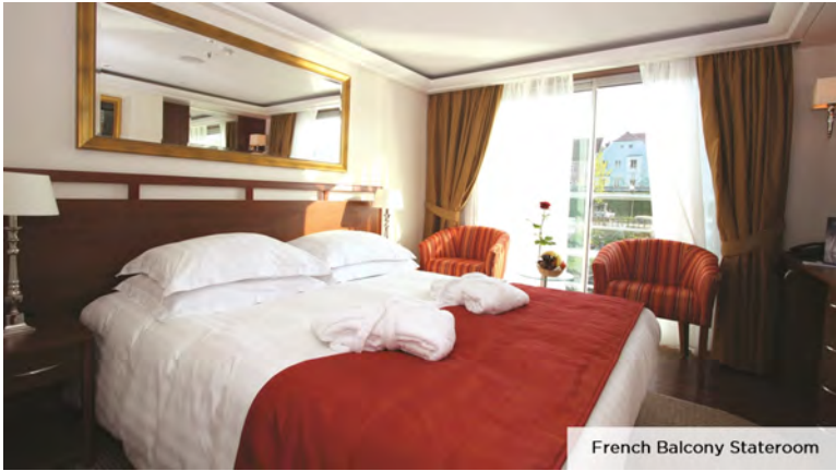
French Balcony Stateroom

7-night cruise | May 1-8, 2025 | Aboard AmaLyra