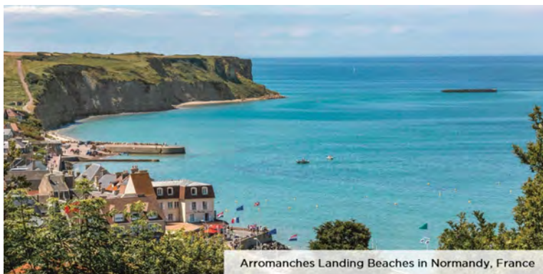
Arromanches Landing Beaches in Normandy, France

OPTIONAL LAND PACKAGE Pre-cruise 2 nights in Paris from $980 per person